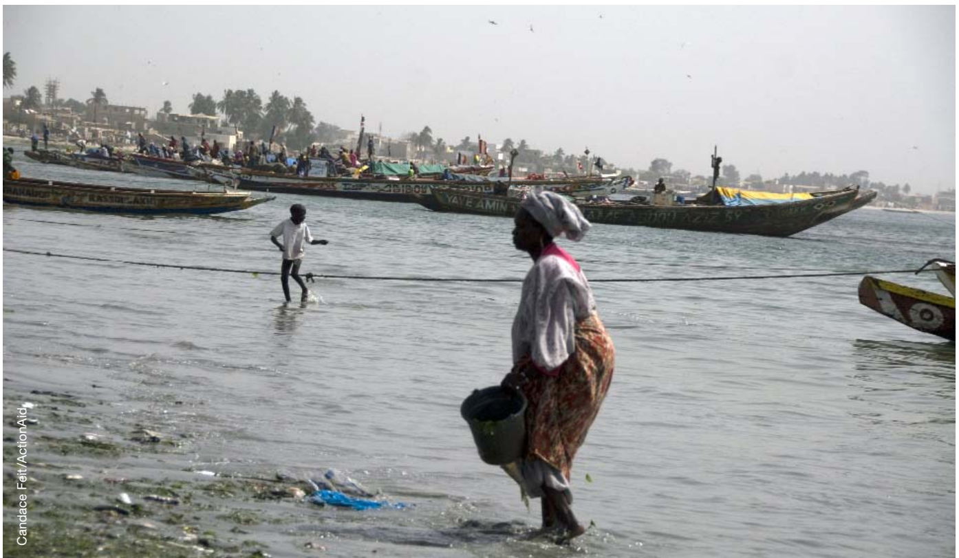
Women are the key actors in the Senegalese fishing industry. Here a woman is unloading fish at the beach in Hahn, one of the main fishing ports supplying Dakar.