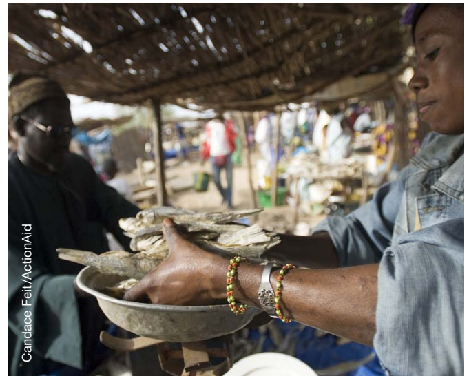
Women who play a vital role in feeding the family through sales of fish at the markets are the hardest hit by over-fishing.

The EPAs could thereby increase the pressure on fish stocks and result in less opportunity for the local industry to process fish, since European boats prefer to ship it directly to Europe. In this case there is likely to be a wave of company closures and a steep drop in income for female employees, job losses in the processing industries as well as a fall in traditional processing activities due to a lack of raw materials. The EPAs would thereby place the food security of hundreds of thousands of women who live off fishing at risk.