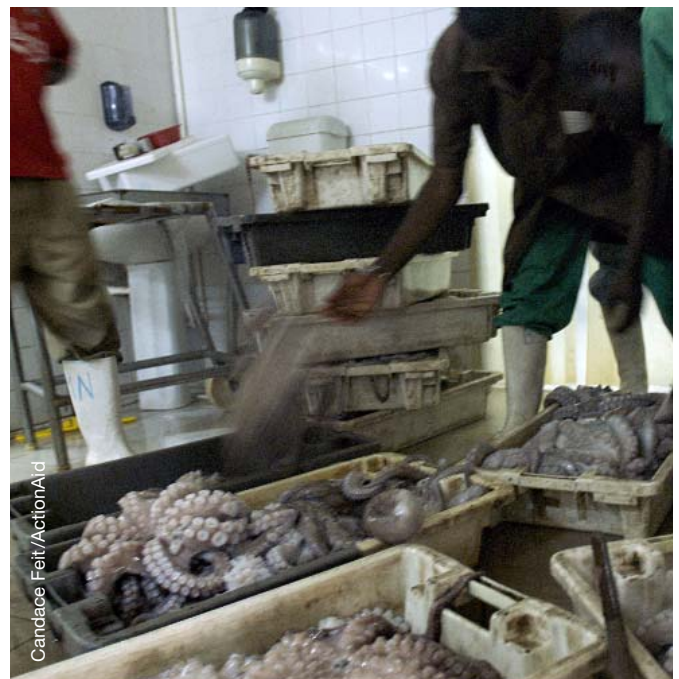
Delivery of octopi to the Royal Pêche processing plant in Dakar.