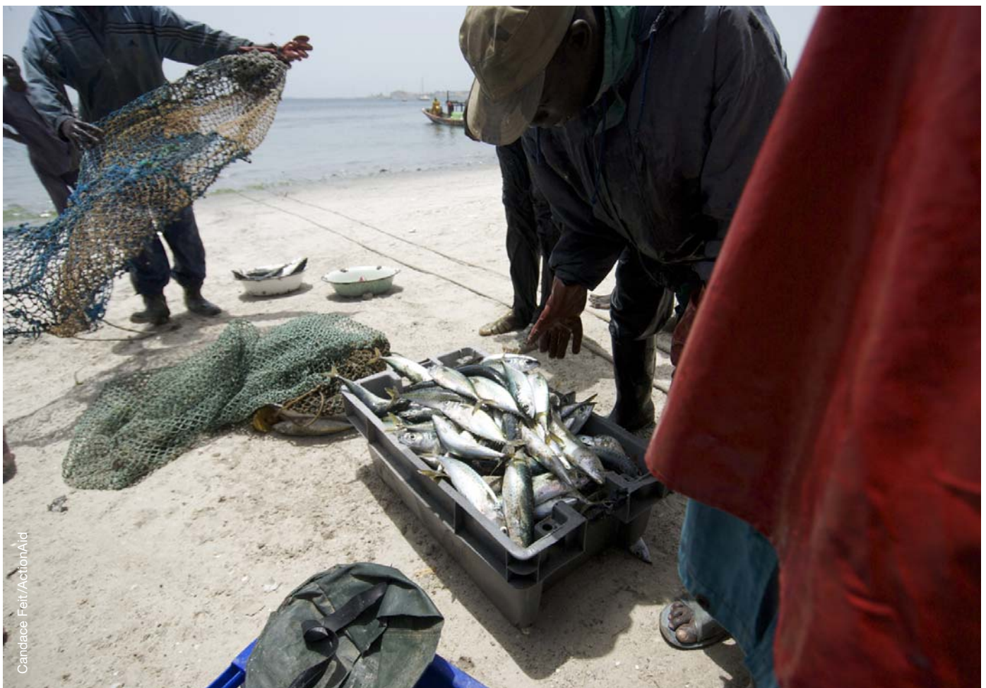
Traditional fishermen unloading their catch at Dakar's Hahn beach have been sorely hit by the over-exploitation of maritime resources.

With regard to the export of fresh or frozen fish, both purchasing power and food habits are key limiting factors for development potentials within the subregion. So, while European markets will remain important for higher value species such as shrimps, sole and octopus, there is a potential to increase exports to emerging economies in Africa, such as Tunisia, Egypt and South Africa. ROYAL PECHE is already exporting to Tunisia and South Africa. Other joint ventures operating in the processing industries are trying to follow suite.